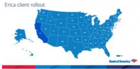
Meet Erica map