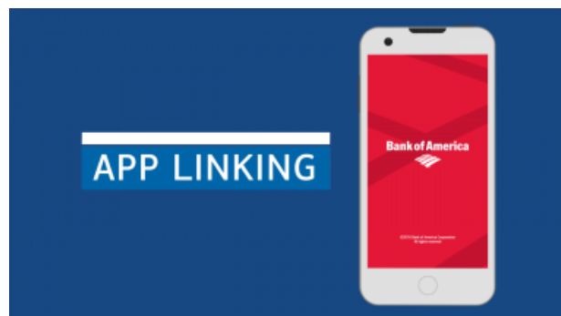
App-to-App Navigation Feature